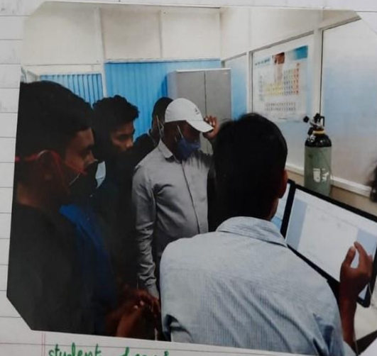
students observing recording of spectra in the lab