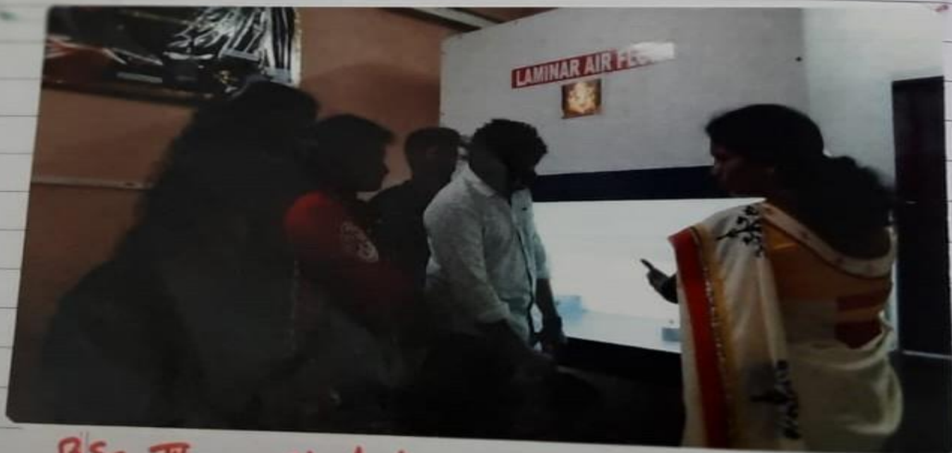
BSc III yr students in the Microbiology department lab.

Nearly Ten students visited microbiology department along with faculty members of Chemistry department. Microbiology department incharge explained Disc diffusion method which is used to study antimicrobial activity. The students were interacted with faculty of microbiology department.