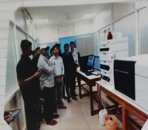
BSc students in the instrumentation lab